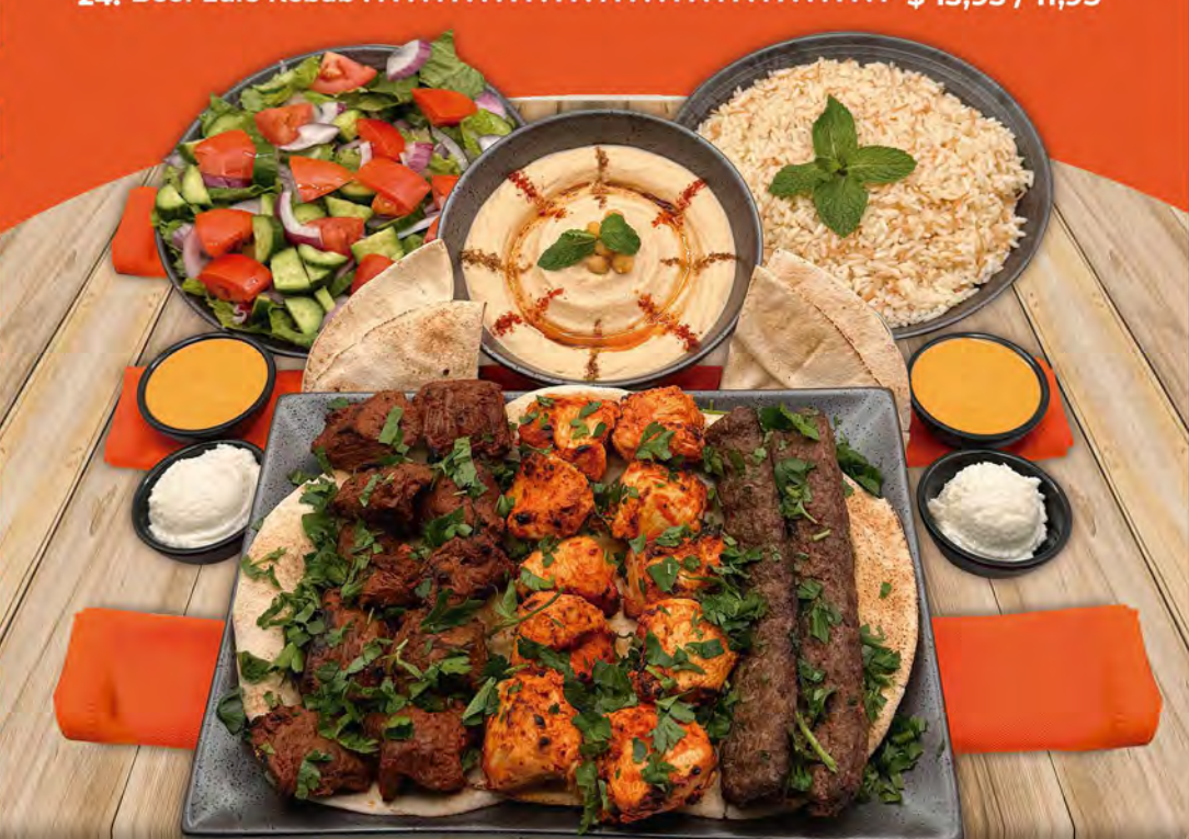
Plate / Skewer