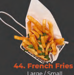
Large / Small $ 6,95 / 4,95